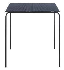
GRILLAGE _ DINING CHAIR WITH QUILTED PAD DINING TABLE & DINING CHAIR. CREATION FRANÇOIS AZAMBOURG