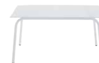
GRILLAGE _ CHAIR OCCASIONAL TABLE & LOVESEAT CREATION FRANÇOIS AZAMBOURG