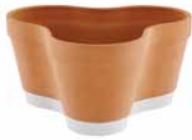
CLOVER POT _ FLOWER POT CREATION KENSAKU OSHIRO