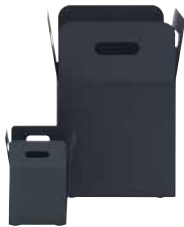
GIARDINETTO _ FLOWER POT CREATION MICHAËL KÖENIG