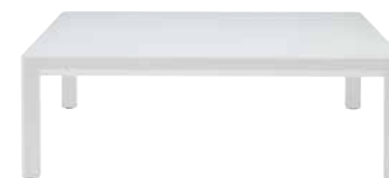
SERAM _ LOW TABLE CREATION PAGNON & PELHAÏTRE