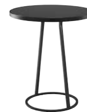
CIRCLES _ COFFEE TABLE CREATION MARIA JEGLINSKA