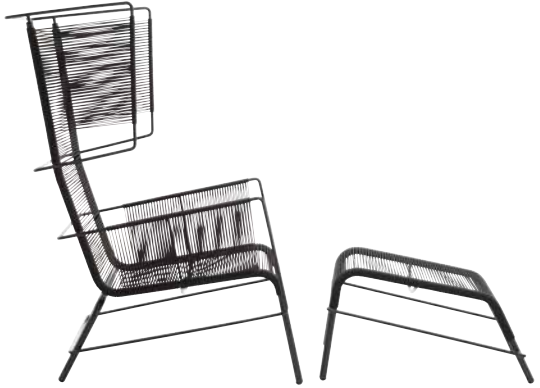
FIFTY _ ARMCHAIR & OTTOMAN. CREATION DÖGG & ARNVED DESIGN