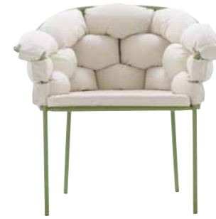
SERPENTINE _ ARMCHAIR BLUE / GREY BLUE — ÉCRU / PALE GREEN — TURQUOISE / ANTHRACITE CREATION ÉLÉONORE NALET