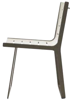
ALUCHAIR _ DINING CHAIR MASTIC / ARGILE — MASTIC / ELEPHANT — ARGILE / ELEPHANT CREATION JACQUES FERRIER