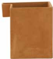
MATERNITY _ PLANT POT CREATION JEAN-FRANÇOIS D'OR