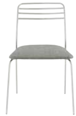
RÉSILLE _ DINING CHAIR WITH ARMS CAFÉ TABLE DINING CHAIR DINING TABLE & ARMCHAIR. CREATION PHILIPPE NIGRO